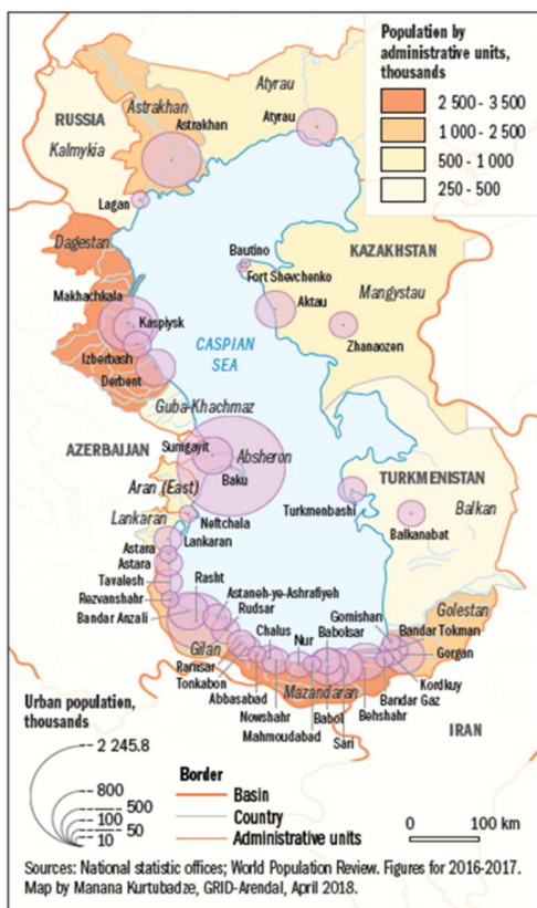
Number of population in the Caspian Sea region per cities and administrative units

While addressing marine litter a special attention must be given to plastic waste. For the past 60 years plastic has brought economic, environmental and social advantages. However, the increase in use and the promotion of products as "disposable" have caused an exponential increase in the amount of plastic waste generated, which brings with it economic, environmental and social issues. Marine plastic litter is generated by both land-based and sea-based activities and requires holistic approach.