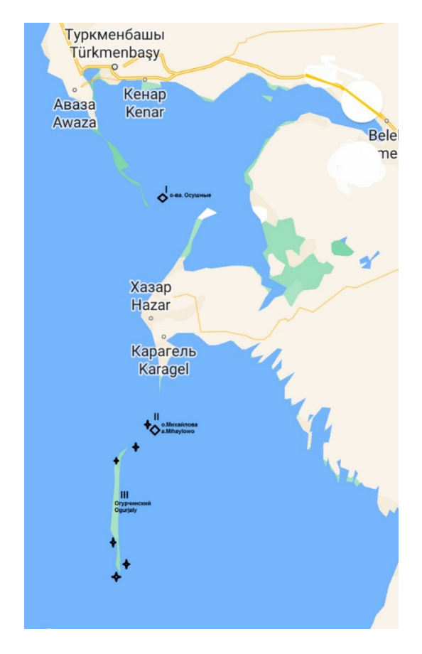
Fig. 1. Locations of registered encounters with Caspian seals in the Turkmenistan area of the Caspian Sea, April – June, 2022: I – Bolshoy Osushnoy and Malyy Osushnoy islands; II – Mikhailova Island; III – Ogurjaly Island; black marks indicate locations of the registered encounters with Caspian seals.

One of the research objectives was to survey the Caspian seal in the Khazarskiy State Nature Reserve (the Khazarskiy and Esenguliyskiy sectors, the Ogurchinsky Sanctuary). Expeditionary routes included Bolshoy Osushnoy Island and Malyy Osushnoy Island in the Turkmenbashi Bay, as well as the Yuzhnaya Chelekenskaya Spit, Mikhailova Island and Ogurjaly (former Ogurchinskiy) Island in the Turkmen Bay (Fig. 1), where the Caspian seal haul outs were most often registered in 2016-2021 (Rustamov et al., 2021).